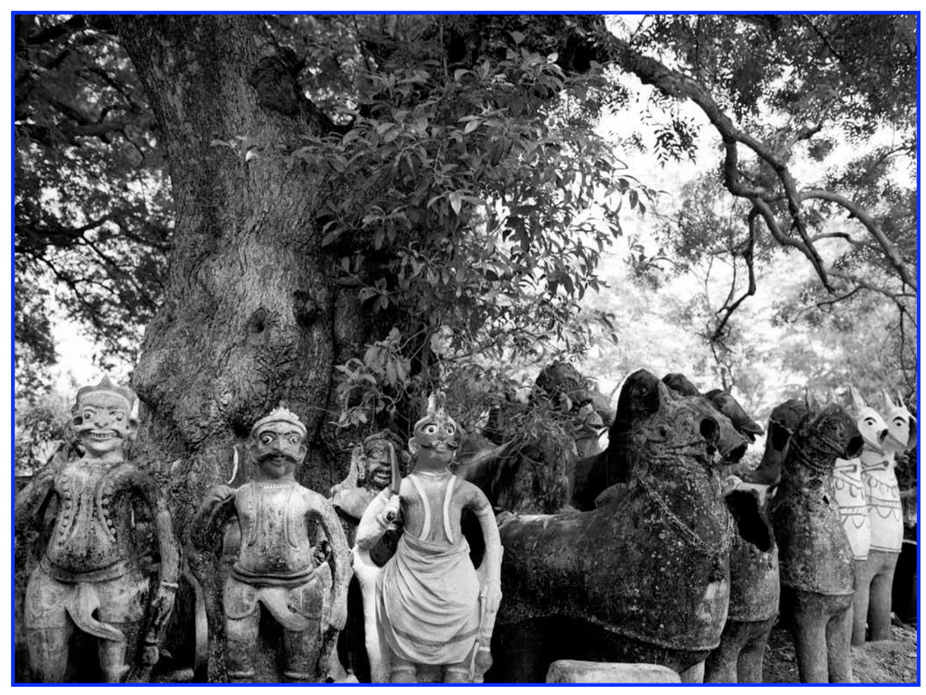
Fig. 5. Aiyanar horses and attendants, Tamil Nadu.

Vishnupad Temple in Gaya (Fig. 6) to honor parents a year after their deaths and to liberate their wandering souls to a state of nirvana [16].