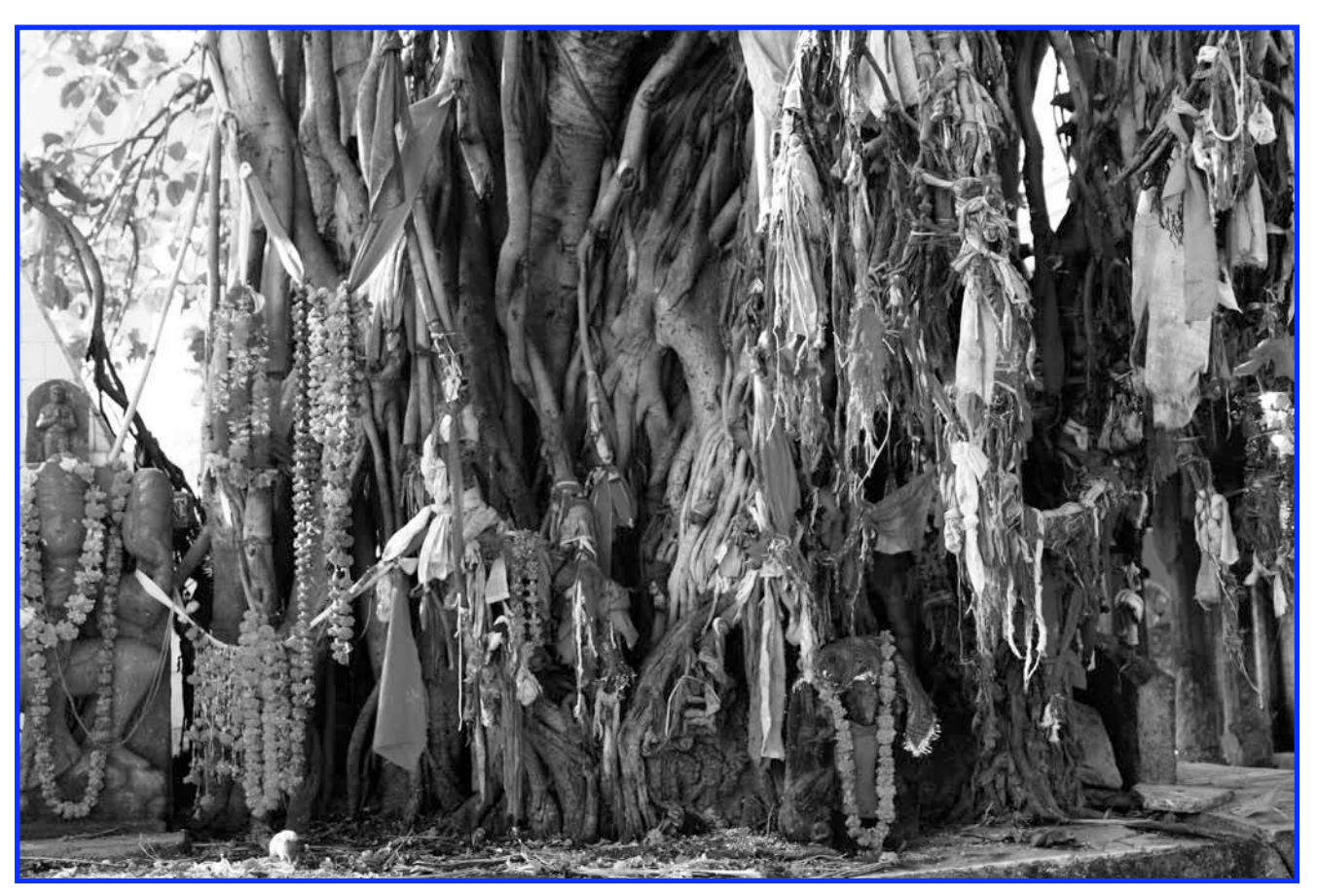
Fig. 6. The sacred pinda tree, Vishnupad Temple, Gaya.

Berry's message by suggesting that the challenge for the contemporary artist is to rediscover sacredness in the world and to initiate a new cultural coding for the ecological age that will aid in the development of an age of ecological awareness/ concern. Gablik blames the Modernist art movement for the "severing of bonds with society" [20]. She calls for artists to meet the challenge of transcending the "disconnectedness and separation of the aesthetic from the social" [21] that she believes existed within modernism. She also states: "The effectiveness of art needs to be judged by how well it overturns the contemporary perception of the world that we have been taught" [22].