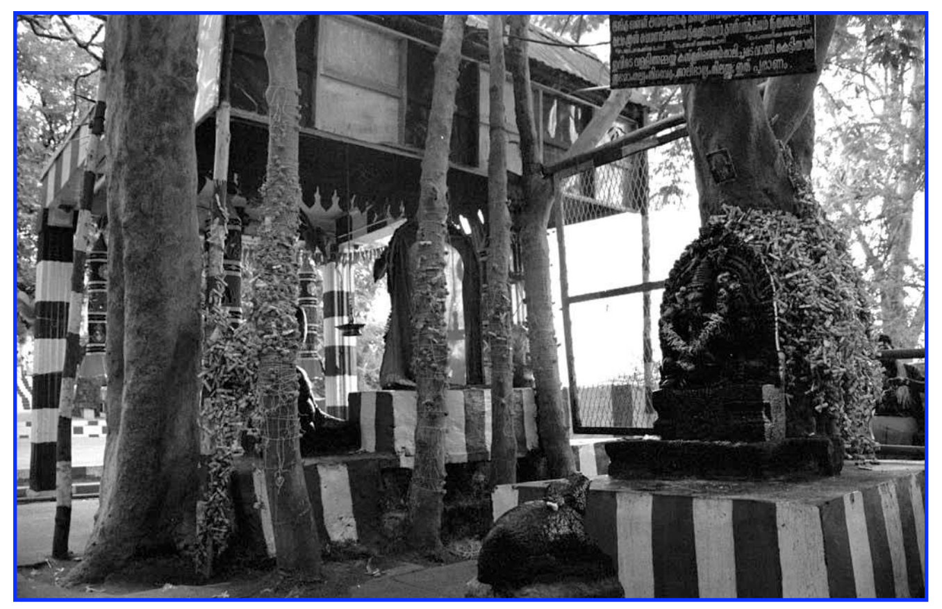
Fig. 1. Sacred tree temple, Palani, Tamil Nadu.

ist perspective. Deforestation is often defended because it provides employment and products, thereby assisting the economy. The "green" argument is that this is a short-term efficiency and that in the long term deforestation will lead to catastrophic consequences for the welfare of humankind and the planet [8]. These competing points of view vie for supremacy in the community, but there is a third perspective that parallels this dichotomy, one that this article sets out to support: the aesthetic argument, wherein the tree is perceived beyond its capture on canvas and instead is perceived aesthetically as an object to be adorned and subsequently adored. I argue here that the idea of society as separate from nature may be challenged through an aestheticism that enables a more symbolic vision of the natural world. This view is supported by my research into sacred trees and other potent examples discussed here that I witnessed in India.