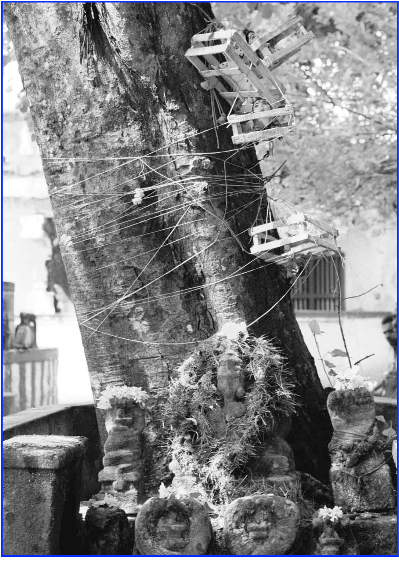
Fig. 4. Fertility tree, Meenakshi Temple.