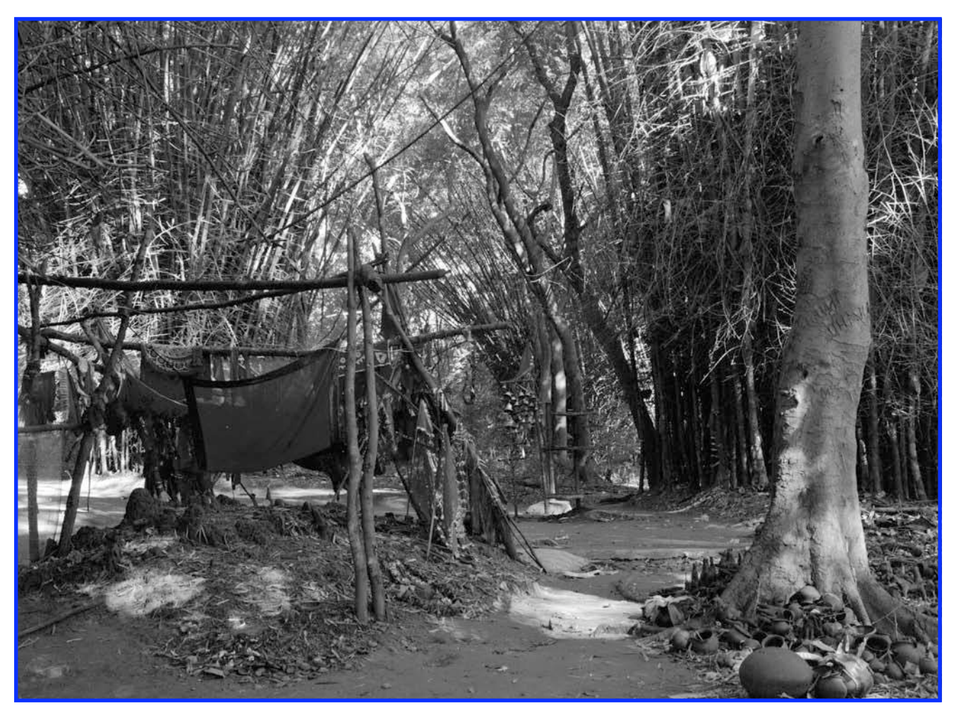
Fig. 2. Sacred bamboo grove, Orissa.

tuaries is as varied as the communities themselves.